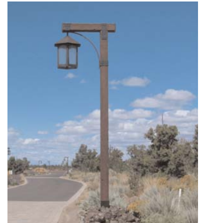
Pronghorn – Bend, Oregon